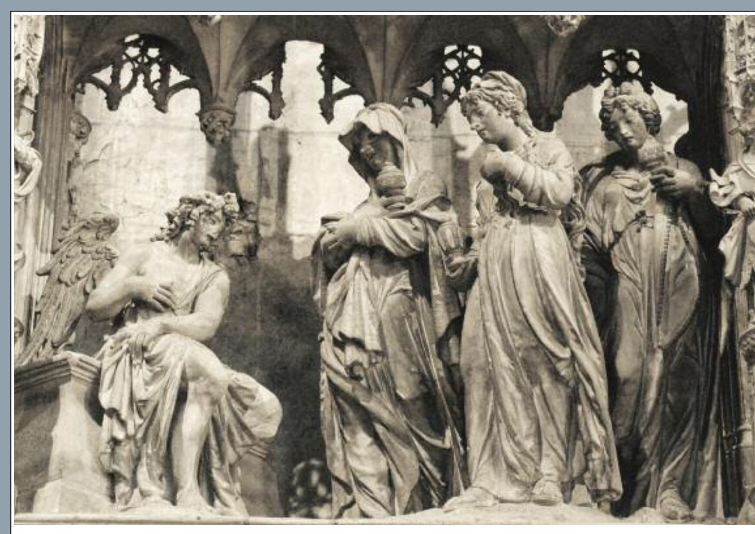
The Three Women at the Tomb.

>>> creativity and knowledge spring, impacting all areas of personal and social life.