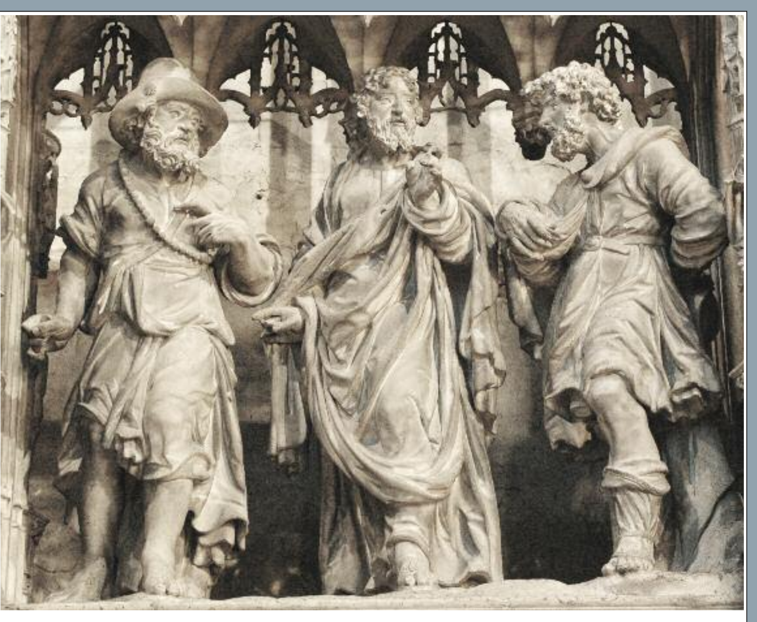
Christ with the Two Disciples at Emmaus.

law does not have. Therefore, in a society in which the principle of the two communities-the origin of the principle of freedom-is in force, you cannot think of imposing a law that has not come from method of civil society, which is first the forming of conviction in practical life and then, in democratic systems of government, parliamentary debate among the elected representatives of the people.