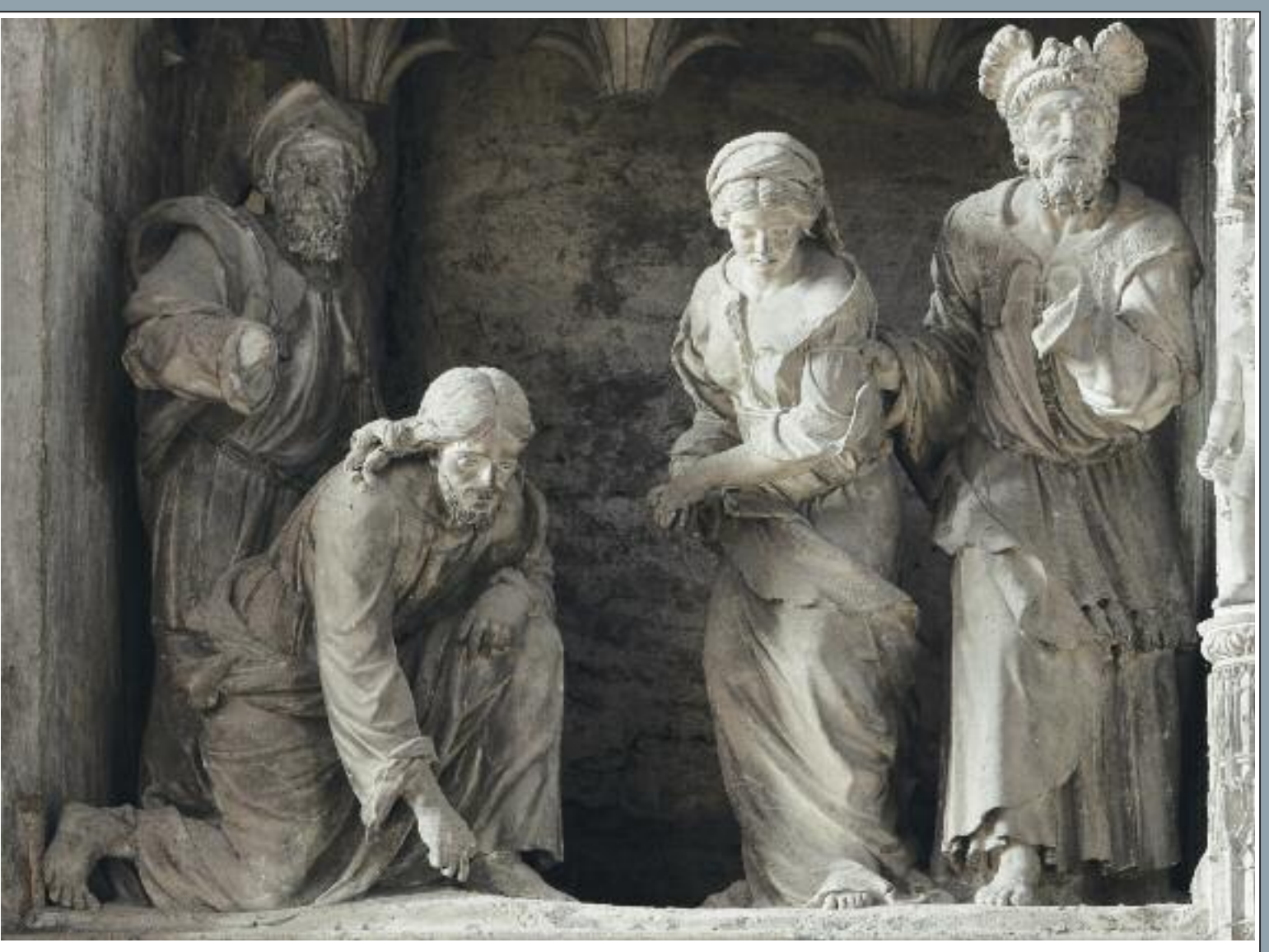
Christ and the Woman Taken in Adultery